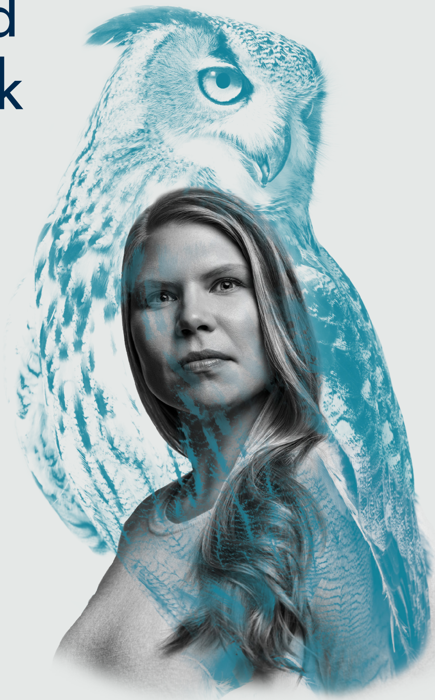
Crystal A. B.A. Special Education M.A. English Language Learning

Eligibility to apply for the Pathway to Teaching Scholarship valued at up to $5,800